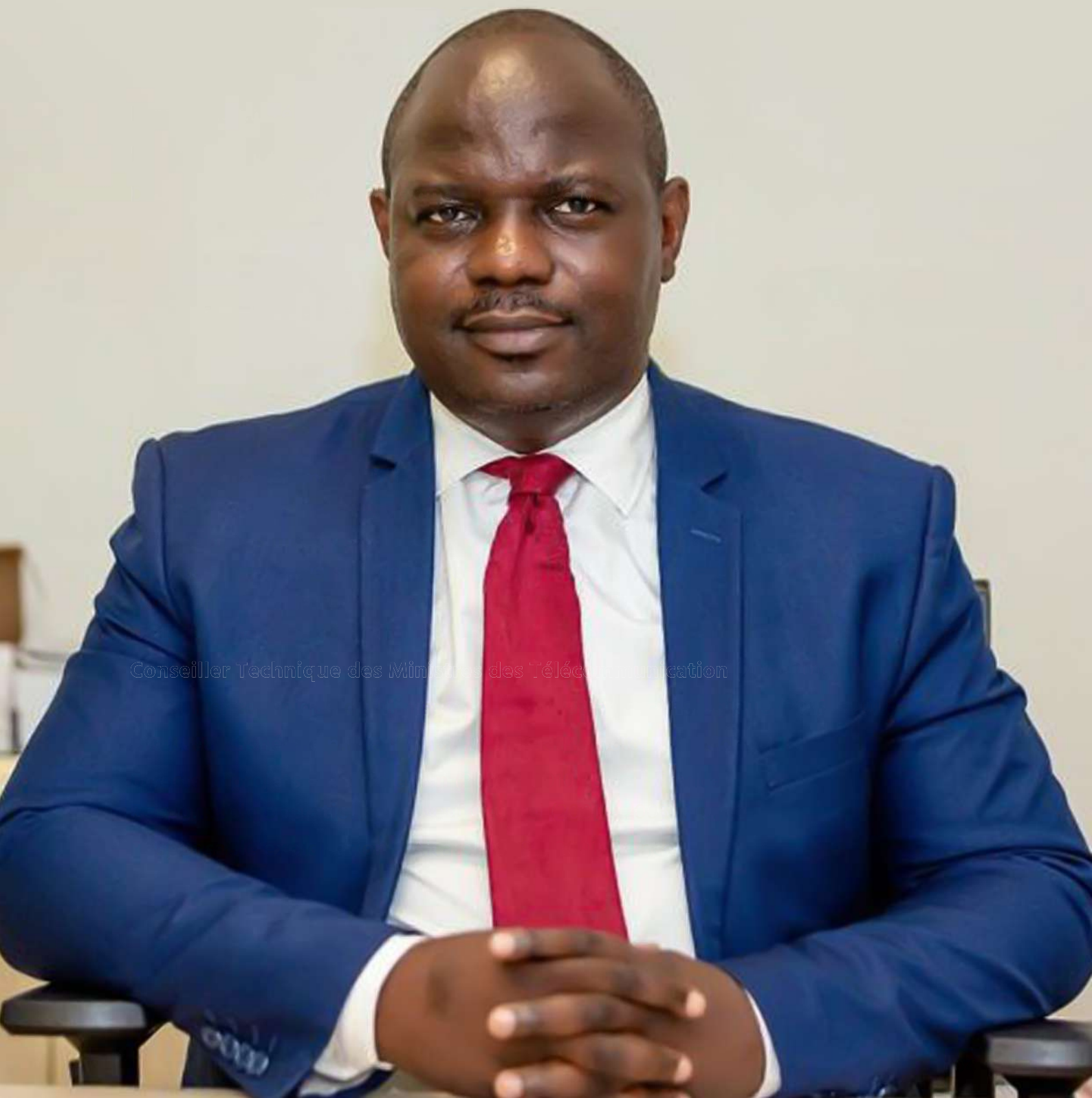
Conseiller Technique des Ministères des Télécommunications