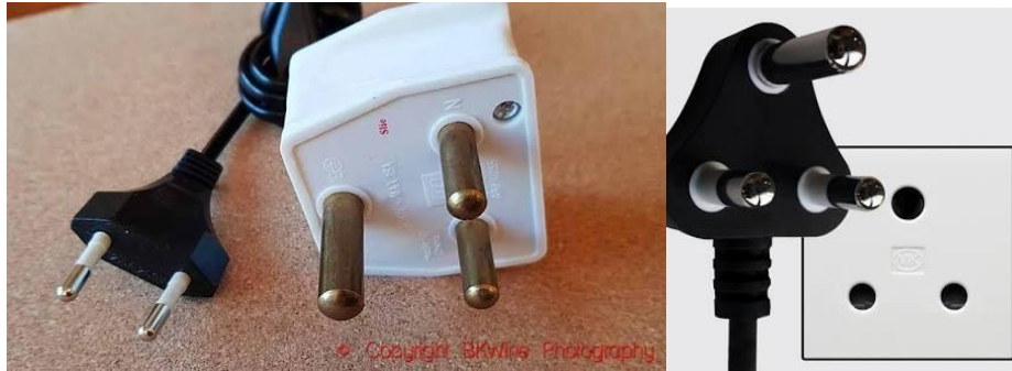
Type M and Type C

South Africa primarily uses Type M (three large round pins in a triangle) for 15A. The voltage is 230V, and frequency is 50Hz. Please refer to the images below: